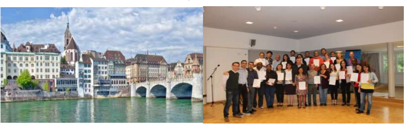
We bring together Academic Institutions, State, Private & Public Sectors